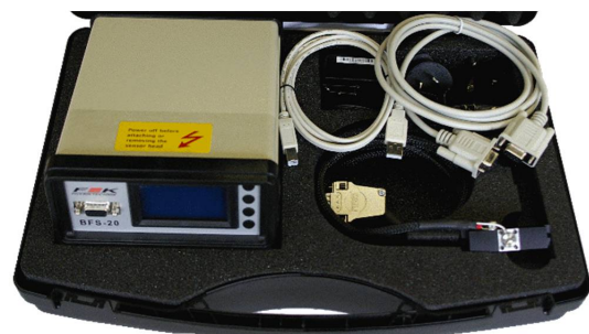
Storage case example. Colour might be different.